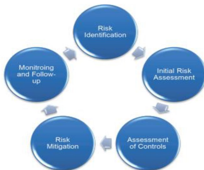
Figure: Continuous Risk Management Process

The Risk Manager identifies the risks the Company faces and records them in a Risk Register, along with details of the specific risk for each identified risk. Thereafter, each risk in the Risk Register is rated in terms of its probability of occurrence and potential financial impact; both estimated by the Risk Manager based on expert judgement, as well as previous events and experience.