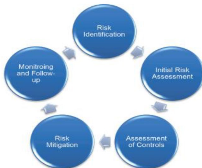
Figure: Continuous Risk Management Process

The Risk Manager identifies the risks the Company faces and records them in a Risk Register, along with details of the specific risk for each identified risk. Thereafter, each risk in the Risk Register is rated in terms of its probability of occurrence and potential financial impact; both estimated by the Risk Manager based on expert judgement, as well as previous events and experience.