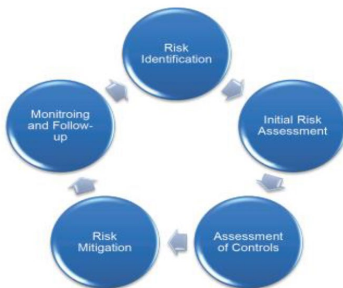
Figure: Continuous Risk Management Process

In order for the Group to proceed to the initial assessment of risks, quantitative and qualitative measures are used. Once the assessment controls are set, the Group attempts to mitigate the significant risks identified and to monitor the progress on mitigation actions when defined. The process followed by the Group, could be described from the below cycle: